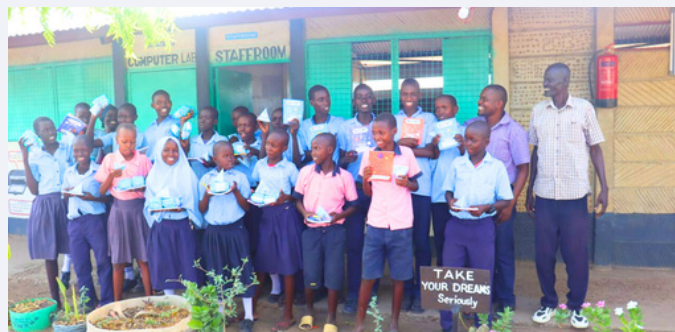
Imarisha project ensures OVC remain in school by providing school fees, uniform & mentorship.

1,154 community members engaged in child protection dialogues, strengthening local child safeguarding systems and raising awareness on abuse prevention.