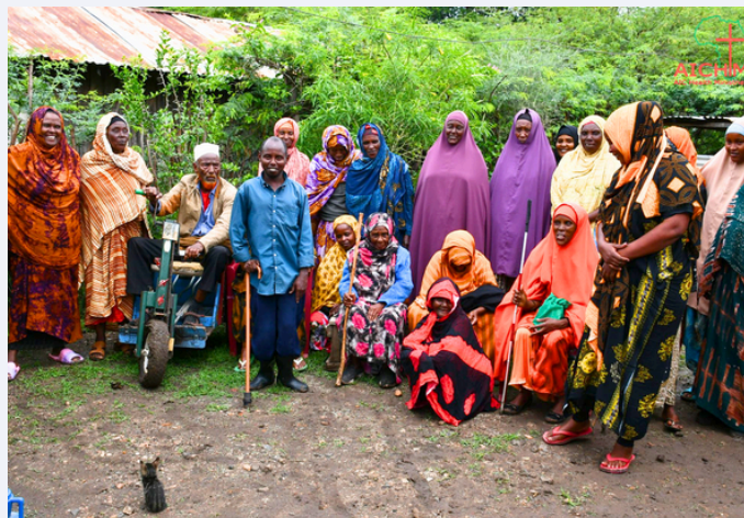
The VSLA initiative has empowered persons with disabilities, fostering financial independence and providing access to low-interest loans to meet their needs.

AICHM also conducted digitalization training for case workers and program staff, introducing Child Protection Information Management Systems (CPIMS) and digital case management tools to enhance service delivery for vulnerable children and families. This technological advancement has improved data collection, tracking of services, and response time for child protection interventions.