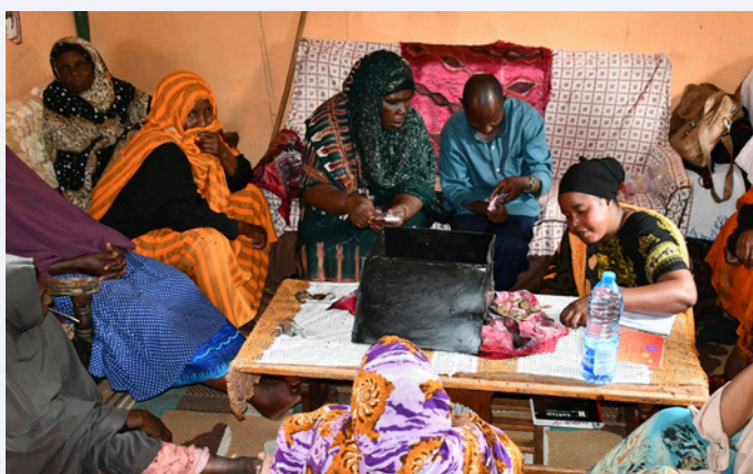
VSAL Group meeting - Caregivers of persons with disability.

The Prevention of Blindness Program directly involved people with disabilities, improving their access to vision-related services. Through the PRIDE and VIP projects, specialized interventions ensured they were prioritized in eye screenings, cataract surgeries, and the provision of assistive devices such as low vision aids and white canes.