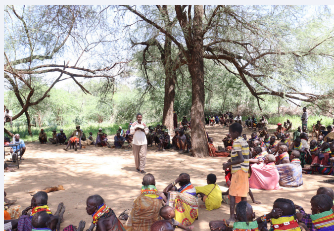
Community Dialogue on Child protection in Turkana.

Through these multifaceted interventions, AICHM strengthened child protection mechanisms, promoted access to essential services, and empowered OVCs with the tools they need to thrive despite adversity.