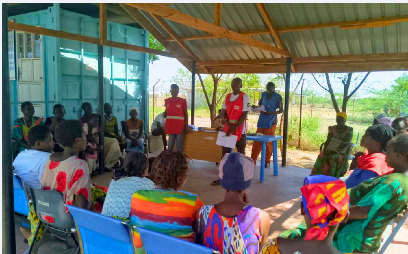
Caregivers being trained on HIV/AIDS prevention and treatment.

The organization achieved an 85% viral load testing coverage, with 83% of individuals achieving viral load suppression, demonstrating effective disease management and signifying improved treatment outcomes.