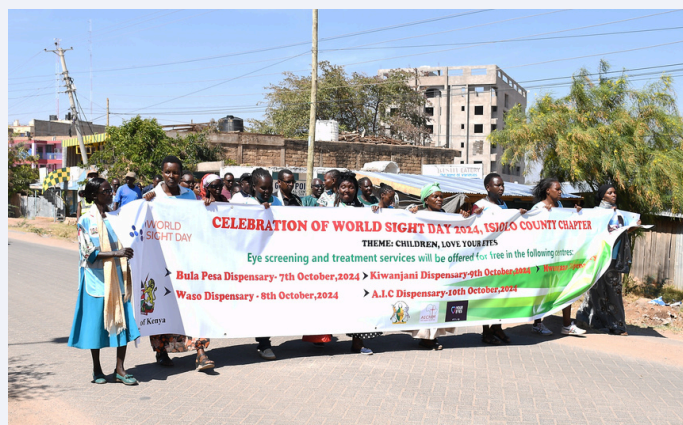
Eye health awareness campaign on world eyesight day.

AICHM also led advocacy and awareness efforts, marking World Sight Day with mass sensitization campaigns and eye health education sessions. These initiatives not only provided treatment but also emphasized the importance of early intervention in preventing avoidable blindness, fostering a community-wide approach to eye health and well-being.