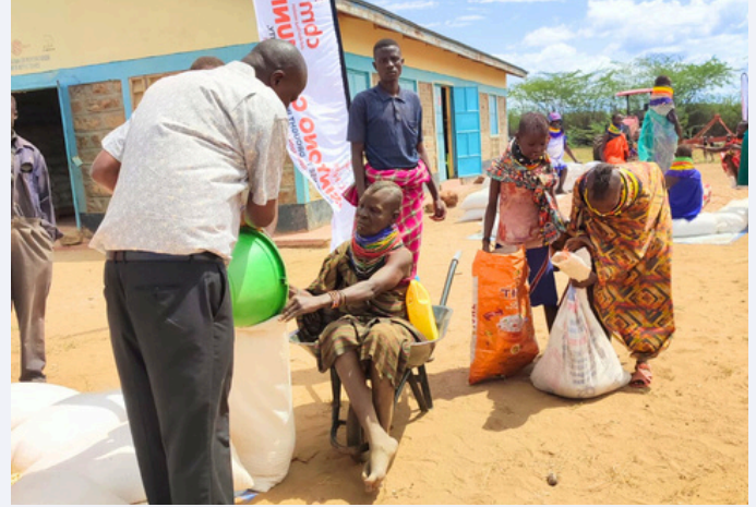
Food Distribution in Nasinyono Turkana West County.

Affected included Nasinyono community Village Unit through provision of non-food items and food stuff to be distributed to the affected families.