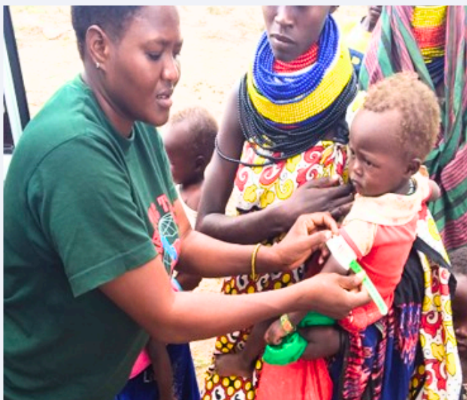
Screening of malnutrition in children

In response to the severe drought and hunger crisis in Turkana West, AICHM implemented a comprehensive emergency response and resilience-building initiative aimed at providing life-saving healthcare and nutrition services to 13,779 beneficiaries from the host and refugee communities. The project significantly improved access to curative and preventive healthcare, targeting children under five, pregnant and lactating mothers, and other vulnerable populations.