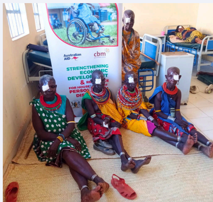
Patients who underwent cataract surgery at a surgical outreach in Isiolo.

To improve early detection and treatment, 325 community health workers received training in primary eye care, empowering them to support local populations effectively. Additionally, the integration of Peek Technology revolutionized how screenings and referrals were conducted, enhancing efficiency and accessibility to specialized care.