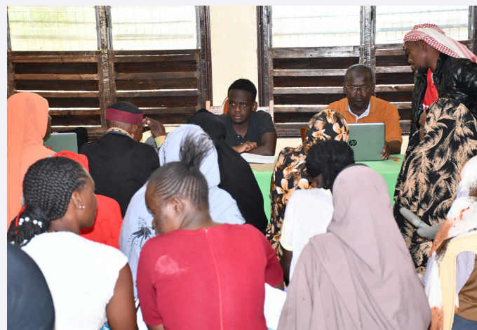
Identification and support of Persons with disability enrollment is social protection schemes.

In 2024, AICHM undertook disability inclusion training for 95 stakeholders, including curriculum support officers, community health workers, and eye care providers, equipping them with strategies for integrating PWDs into health and education services.