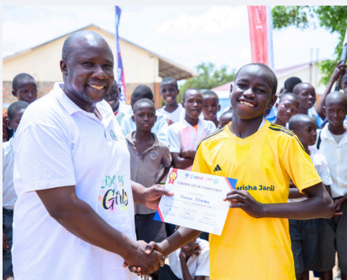
OVC Graduation Ceremony.

In addition, AICHM facilitated the graduation of 148 OVC, successfully transitioning them into self-sufficiency through vocational training and economic empowerment programs. Special attention was given to children living with HIV, ensuring 808 HIV-positive OVC received ART adherence support, psychosocial counseling, and regular health monitoring to improve treatment outcomes.