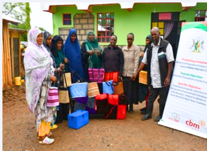
Significance of financial literacy and training.

Recognizing the importance of financial independence, AICHM facilitated financial literacy training for youth and caregivers, equipping them with essential skills in budgeting, saving, and income generation. Through Village Savings and Loan Associations (VSLA), AICHM trained 13 community groups, empowering them with financial tools to establish sustainable economic activities.