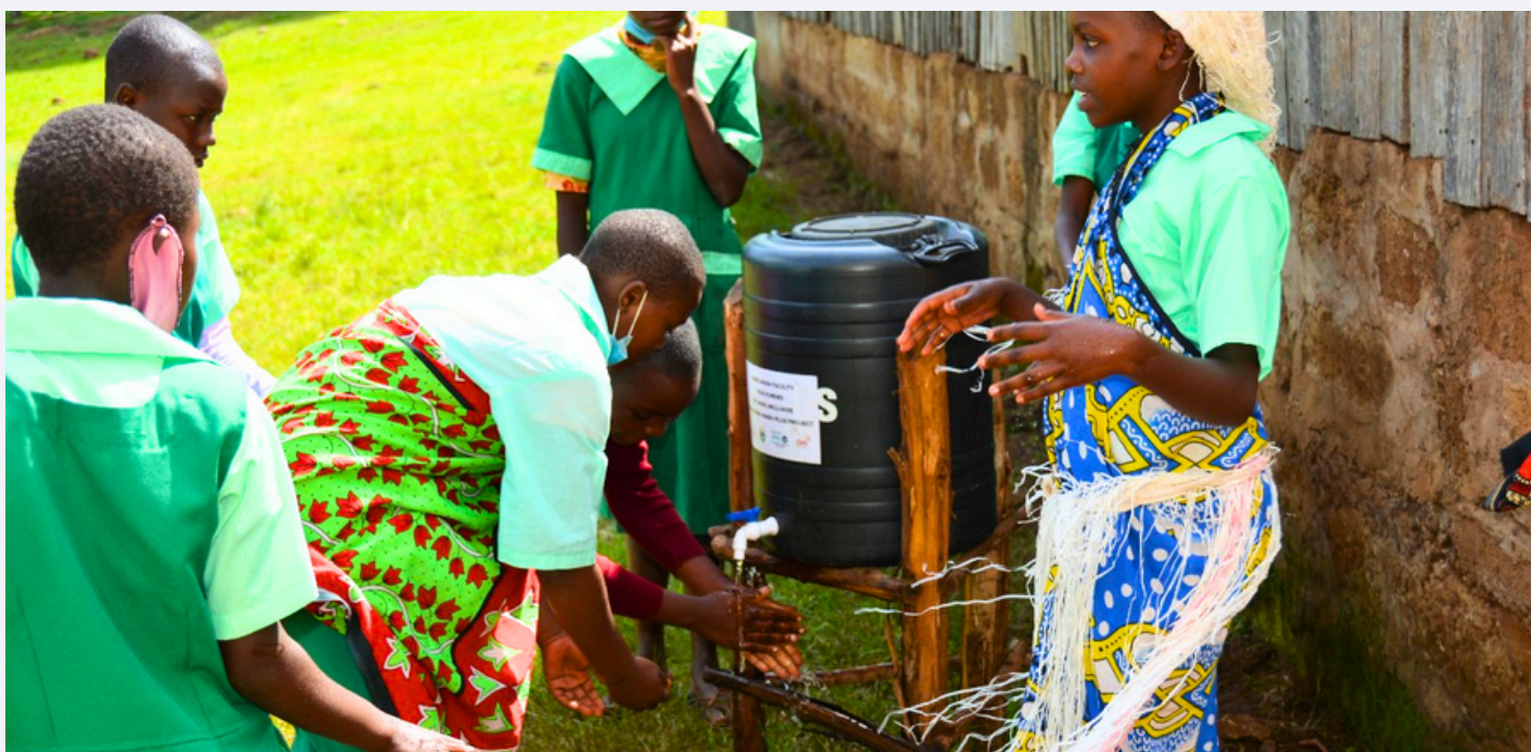
Students observing hygiene practices taught by washing hands.

To address the issue of open defecation and poor sanitation, AICHM facilitated the construction of latrines and handwashing facilities in 10 villages, significantly improving sanitation conditions and reducing the spread of waterborne diseases.