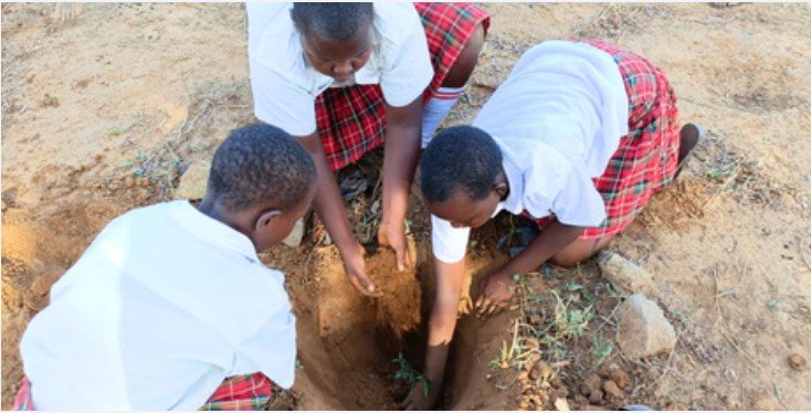
Tree planting by school children in Naana, Turkana County

AICHM recognizes that a healthy environment is fundamental to public health. As part of its sustainability efforts, 1,245 trees were planted through school and community initiatives, fostering environmental conservation and climate resilience. The organization also integrated climate resilience strategies into health programs, ensuring that interventions account for the impact of climate change on health.