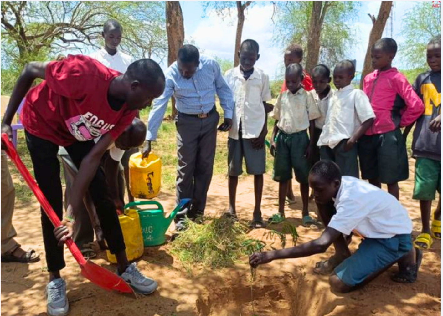
Children rights club planting trees, Turkana.

1,245 trees were planted through school and community initiatives fostering environmental conservation and climate resilience.