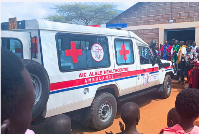
An Ambulance donated to AIC Alale Health Centre.

church council and area church council where the facility falls. AICHM maintained its committed to ensure sustainability of all its health facilities by providing governance support and fostering strategic partnerships through its program, partner hospitals as well as bodies like CHAK, MoH and other strategic partners, these partnerships yielded valuable support including drugs, equipment, personnel, and professional assistance as well as infrastructure donations. Additionally, the department actively supported rural health facilities in navigating the transition process from NHIF to SHA system, to ensure they are not left behind with the new government evolvement landscape and they all adapted in the evolving health development.