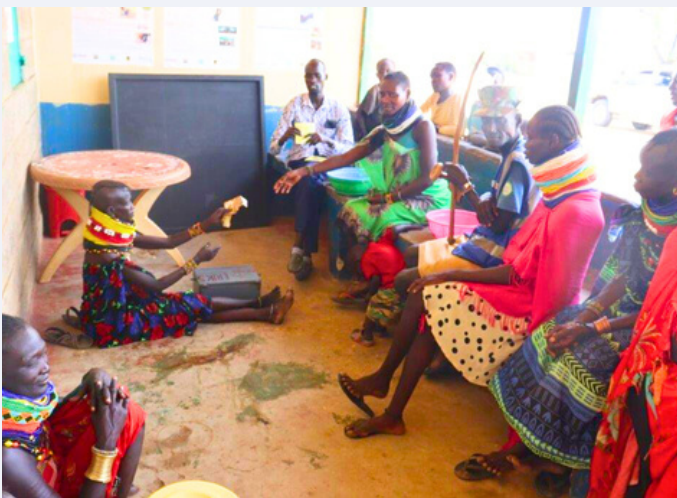
Village Savings and Loan Associations is empowering women and their households.

Additionally, 870 community health promoters underwent training in primary eye care, enhancing their ability to identify and manage eye conditions at the community level.