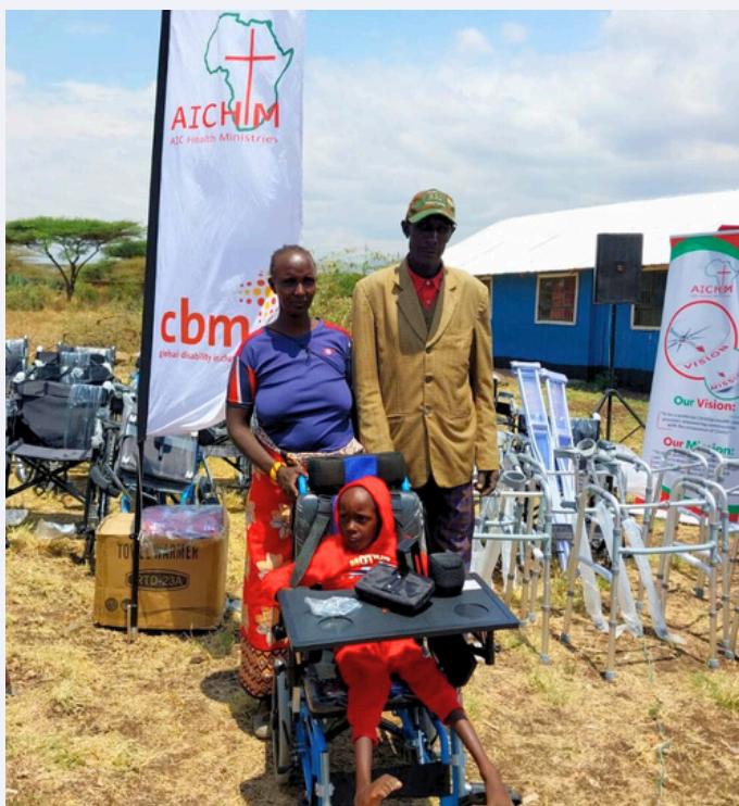
Distribution of assistive devices to persons with disability.

AICHM prioritized the inclusion of persons with disabilities (PWDs) across all its health programs, ensuring access to healthcare, education, and socio-economic empowerment opportunities. In 2024, AICHM undertook disability inclusion training for 95 stakeholders, including curriculum support officers, community health workers, and eye care providers, equipping them with strategies for integrating PWDs into health and education services.