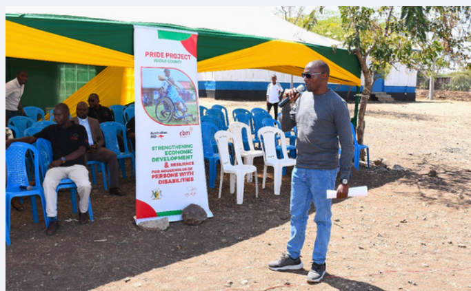
World sight day celebrations.

Through 11 surgical outreaches, AICHM successfully restored sight for 1,577 individuals, giving them the ability to lead independent lives once more.